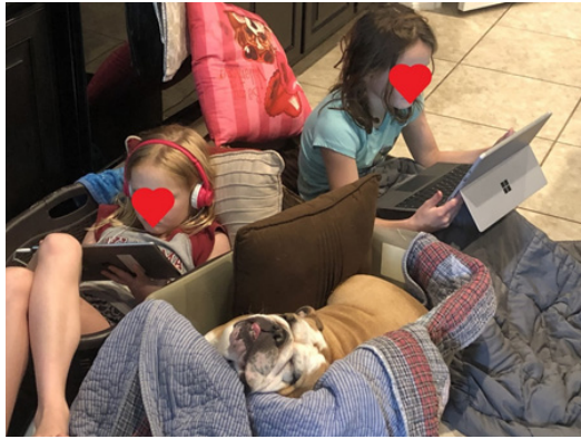
Author's Children 'Doing School' at Home